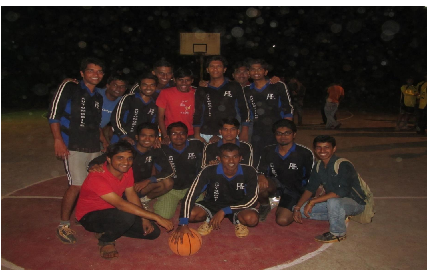
Basketball Play Ground