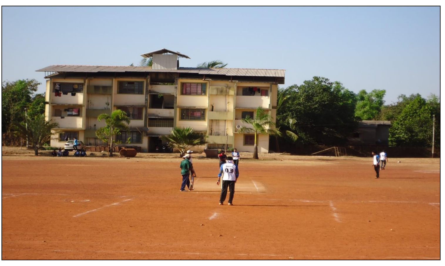
Cricket Play Ground