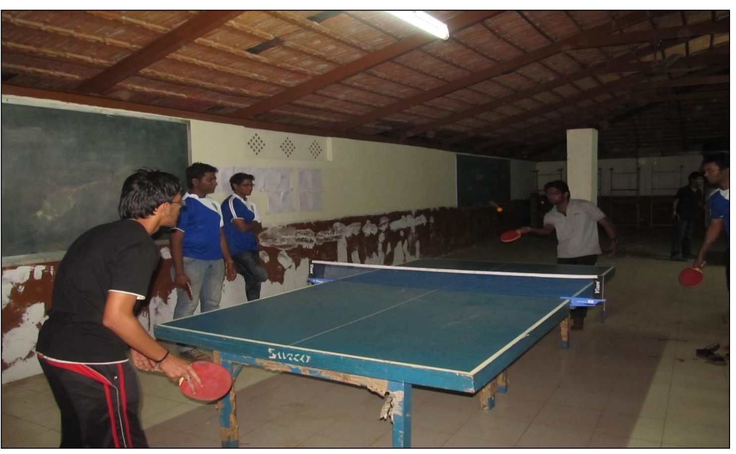
Table Tennis Court Specification (3 tables, 4 pairs Rackets, 12 balls, 3 nets)