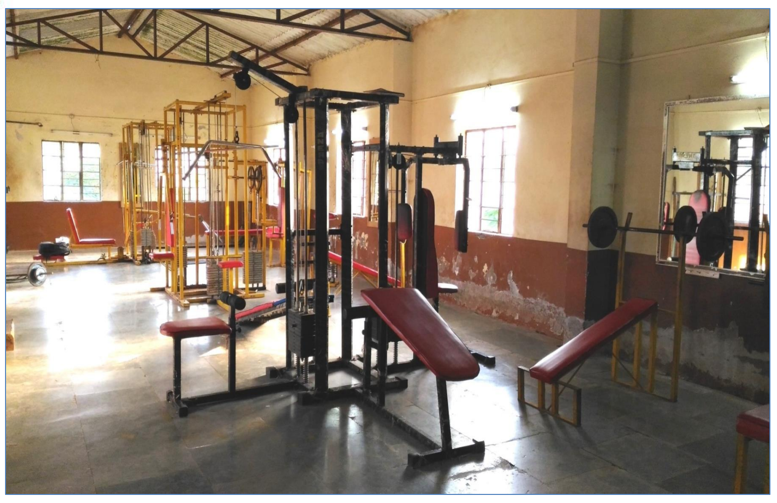
Well equipped Gymnasium Total Area 124.86 Sq. m.