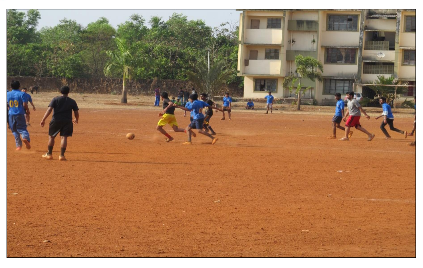
Football Play Ground