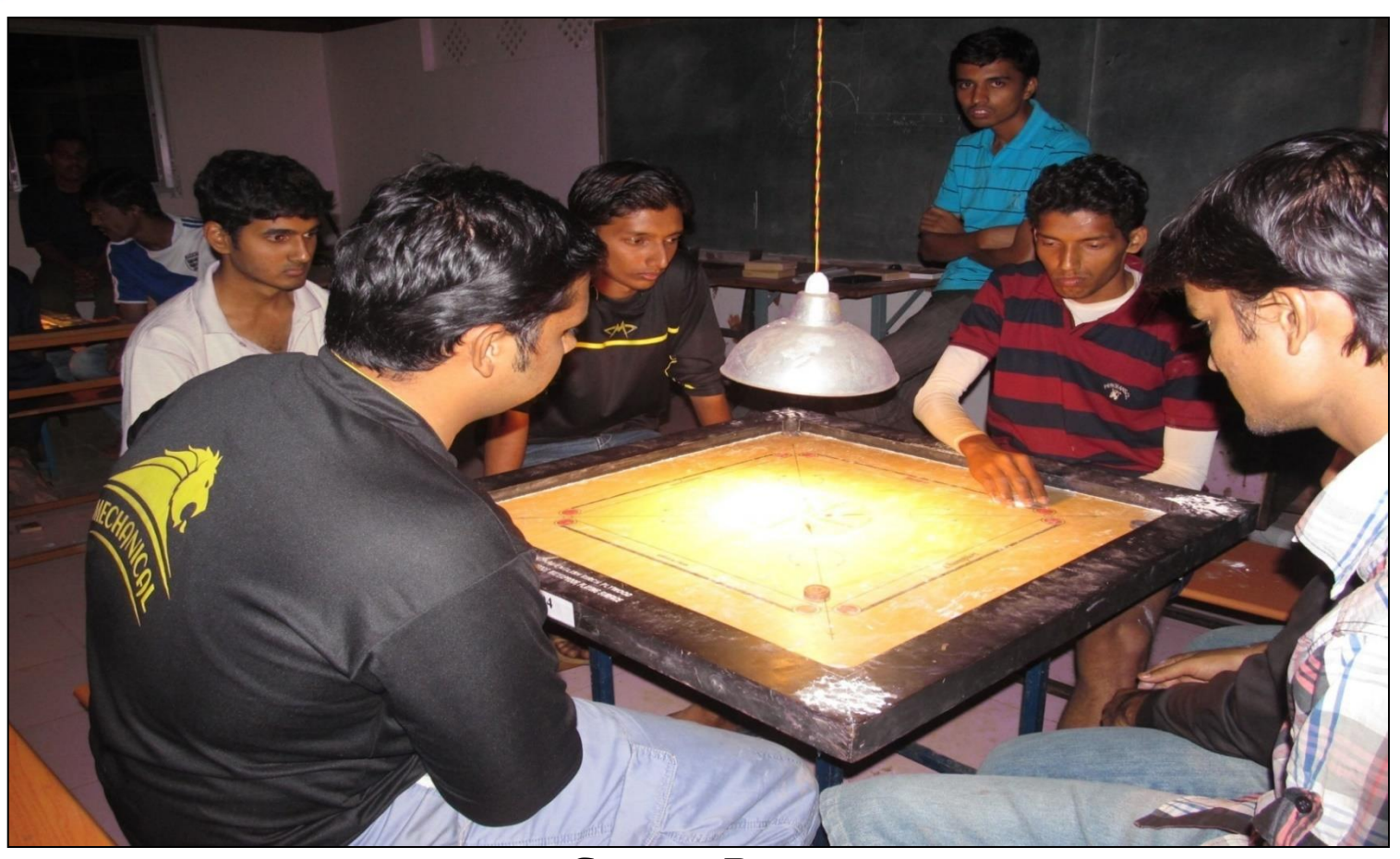
Carrom Room Specification (4 boards with coins )