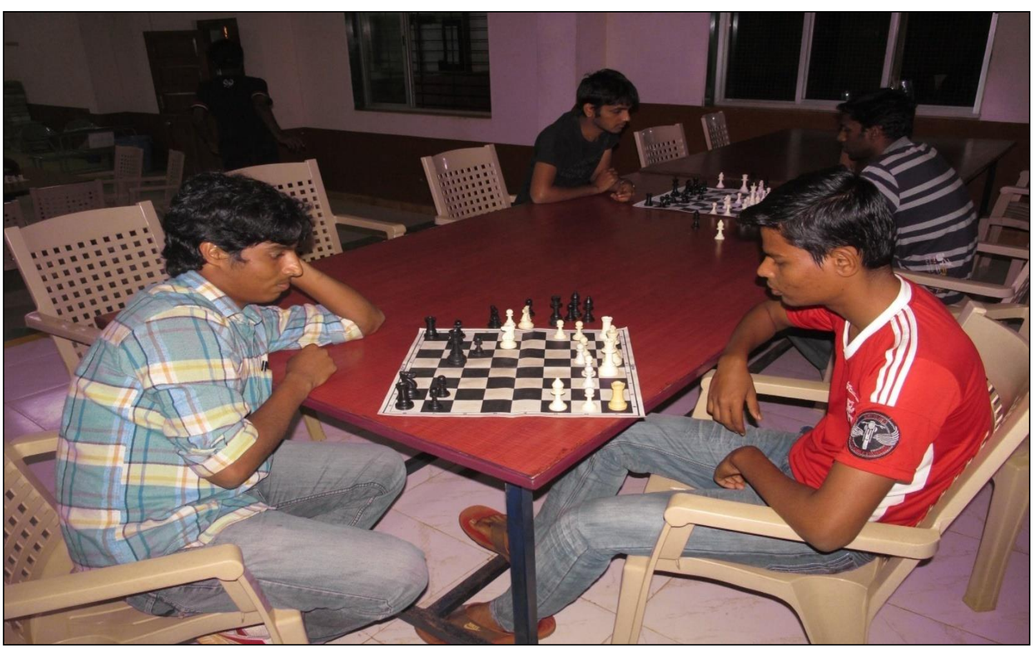
Chess Room Specification (5 sets)